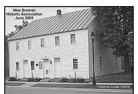
NBHA Museum - 120 N. Main St.

New Bremen Historic Association P.O. Box 73 New Bremen, Ohio 45869-0073